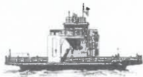
Sugar Islander II

Ferry leaves Sugar Island on the hour and half-hour.