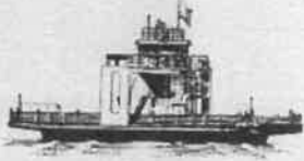
Sugar Islander II

Ferry leaves Sugar Island on the hour and half-hour.