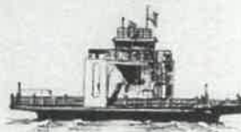
Sugar Islander II

Ferry leaves Sugar Island on the hour and half-hour.