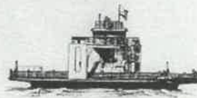
Sugar Islander II

Ferry leaves Sugar Island on the hour and half-hour. From 5:00 a.m. till 2:00 a.m. 3:00 a.m. 4:00 a.m.